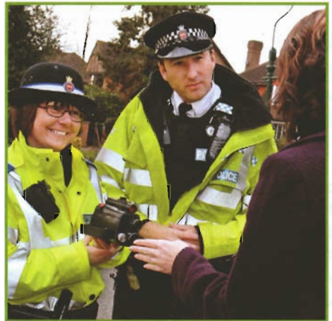
Community Speedwatch is helping to slow down traffic in the area

Volunteers are given training by police and use monitoring equipment to record speeding vehicles, details of which